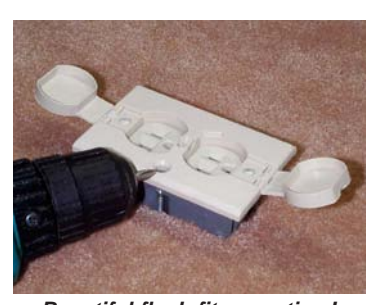
Beautiful flush fit every time!

Floor box kit should be installed by a certified electrician