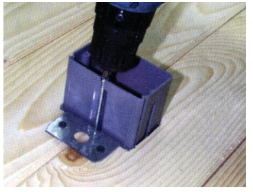
Screw in to adjust to height of flooring or carpet.

This floor box is designed to be mounted on a joist or subfloor. It can be installed on the top of the joist or from the bottom if the thickness of the joist is sufficient to allow installation of the box. If the unit is to be installed from the bottom of the joist, check prior to installation to ensure there is sufficient adjustment remaining as this type of installation is non-standard.