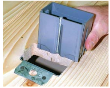
Install clip over subfloor.