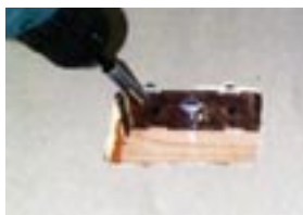
Old work bracket installation for tight locations or cut-in situations