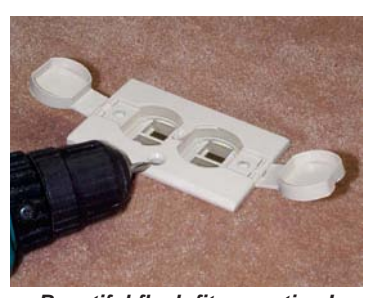
Beautiful flush fit every time!

This low voltage floor bracket assembly is designed to be mounted on a joist or subfloor. It can be installed on the top of the joist or from the bottom if the thickness of the joist is sufficient to allow installation of the bracket. If the unit is to be installed from the bottom of the joist, check prior to installation to ensure there is sufficient adjustment remaining as this type of installation is non-standard.