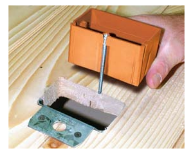
Install clip over subfloor.