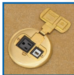
Data Jack not included

Innovative Solutions For Wire and Cable Management.