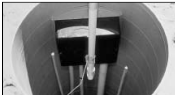
1. J-Box, with all conduit and fittings placed as desired, is temporarily attached to the concrete form – base and lid inside.