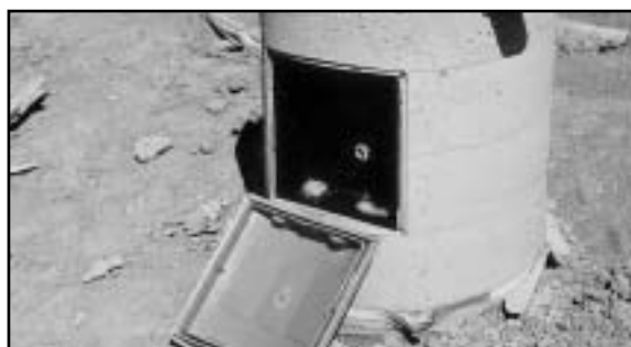
3. Pop off the J-Box lid, leaving an 8" x 8" x 4" or 12" x 12" x 4" access area, depending on the J-Box selected.