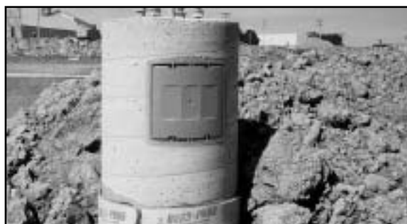
4. After wiring is completed, the lid is replaced to complete the installation.