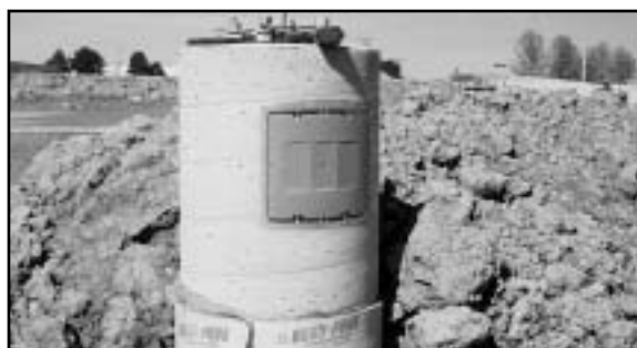
2. Remove form after concrete has been poured and allowed to cure.